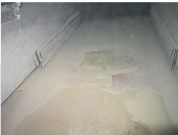
Image 1 - Conveyor chute with PUCEST lining, after 7 months of permanent load

Being in use, for example as lining of a vibrating chute, the properties of the hybrid plate result in an optimum conveying result.