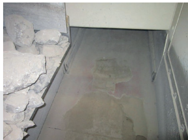
Image 2 - Conveyor chute with PUCEST lining, after 7 months of permanent load